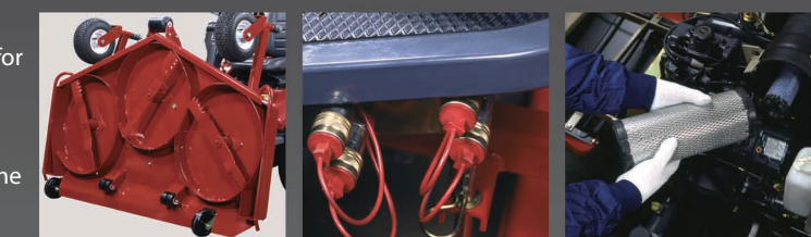
Flip-up mower deck