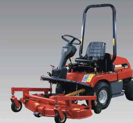
CM214 24 hp/ (17.6 kW)

The Shibaura diesel engines are ideal when it comes to easy maintenance. On one side of the engine, you can check the oil level, replace the oil filter and complete some other necessary maintenance.