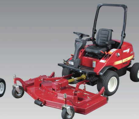
CM314 33.9 hp/ (25.5 kW)